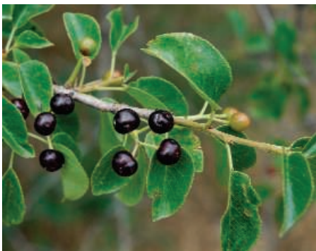
Prunus mahaleb in fruit.

Although a great deal is known about the qualitative aspects of seed dispersal by animals (for example, which species feed on particular plants and disperse their seeds), the quantitative study of seed dispersal is still in its infancy. For example, the relative roles of different animal species in dispersing seeds over different distances are unclear. Genotyping techniques, coupled with detailed field observations, are beginning to yield results. Jordano et al. assessed the relative contributions of large birds, small birds, and fruit-eating mammals to the dispersal of seeds of Prunus mahaleb , a common fleshy-fruited tree in southern Spain, by genotyping seeds in fecal pellets and match-