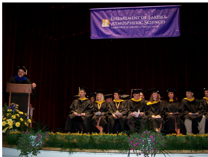
DAES Undergraduate Commencement ceremony

Graduates with a B.S. in Environmental Science will be well qualified for a broad range of positions within the highly interdisciplinary field of environmental science. Consulting firms, industry, federal and state government agencies all require employees with this type of training. The demand for individuals with such a degree is anticipated to remain strong as our society attempts to cope with and address a myriad of environmental impacts that are occurring on local, regional, national and global scales. Additionally, graduates with this degree are well prepared to consider advanced degrees in the sciences, or other fields such as business administration (M.B.A.) or law (J.D.). In fact many of our undergraduate degree recipients advance to graduate study.