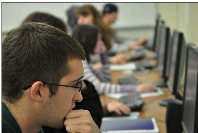
Students hard at work in a DAES classroom

The department also offers a Bachelor of Science degree in Atmospheric Science . This degree provides a more specialized education in meteorology and weather forecasting for students interested in atmospheric processes. Additional information on the Atmospheric Science degree is given in a separate brochure.