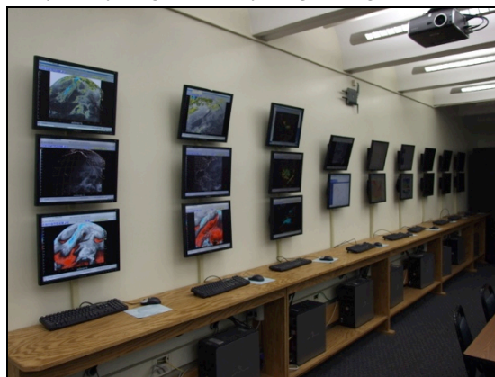
Atmospheric Science Map Room

Environmental Science Programs around the country vary significantly regarding their main focus and emphasis toward certain aspects of the environment. While some Departments emphasize Environmental Policy, Environmental Health, Environmental Law or Ecology, the strength of our program lies in its core emphasis on the Natural Sciences. Our students are required to take two semesters of calculus, physics and chemistry which give them a very solid foundation to understand and analyze the natural processes that dominate our environment. We also encourage all our Environmental Science students to acquire some working experience by serving as an intern with an environmental consulting firm or a local, state or federal agency. The students earn credit for the internship, but it also gives them a valuable working experience with a potential future employer. Hence our students graduate with a competitive advantage in the job market for all positions that require work experience, a solid scientific background and advanced quantitative skills.